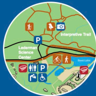
2 LEDERMAN SCIENCE CENTER AND OUTDOOR AREA