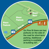
3 BISON PASTURE AND VIEWING