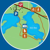
4 A.E. SEA NATURE AREA