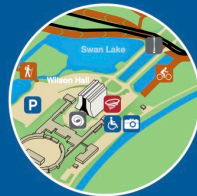
1 WILSON HALL, OPEN FOR ESCORTED PUBLIC TOURS ONLY

The public is invited to visit the Fermilab site to enjoy the following permitted activities: observing the bison herd, walking, hiking, bicycling, running, rollerblading, skateboarding, roller-skating, cross-country skiing, snow shoeing, bird watching, interpretive trails, photography, and painting. Additional parking to view the bison herd is available at Building 327. For more information on tours and things to do at Fermilab go to www.fnal.gov/pub/visiting